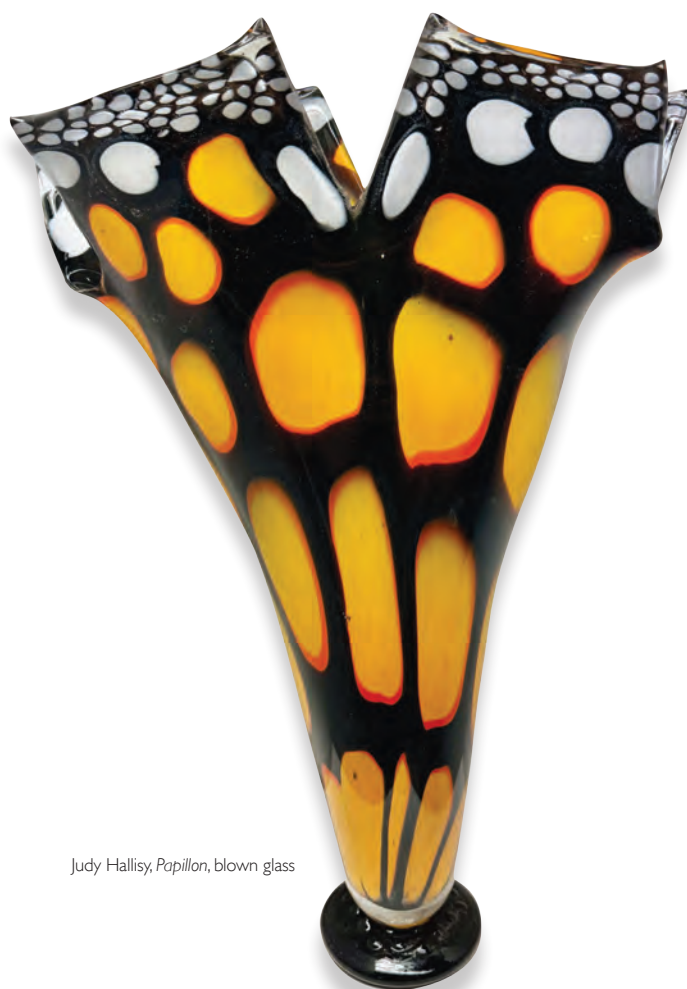
Judy Hallisy, Papillon , blown glass