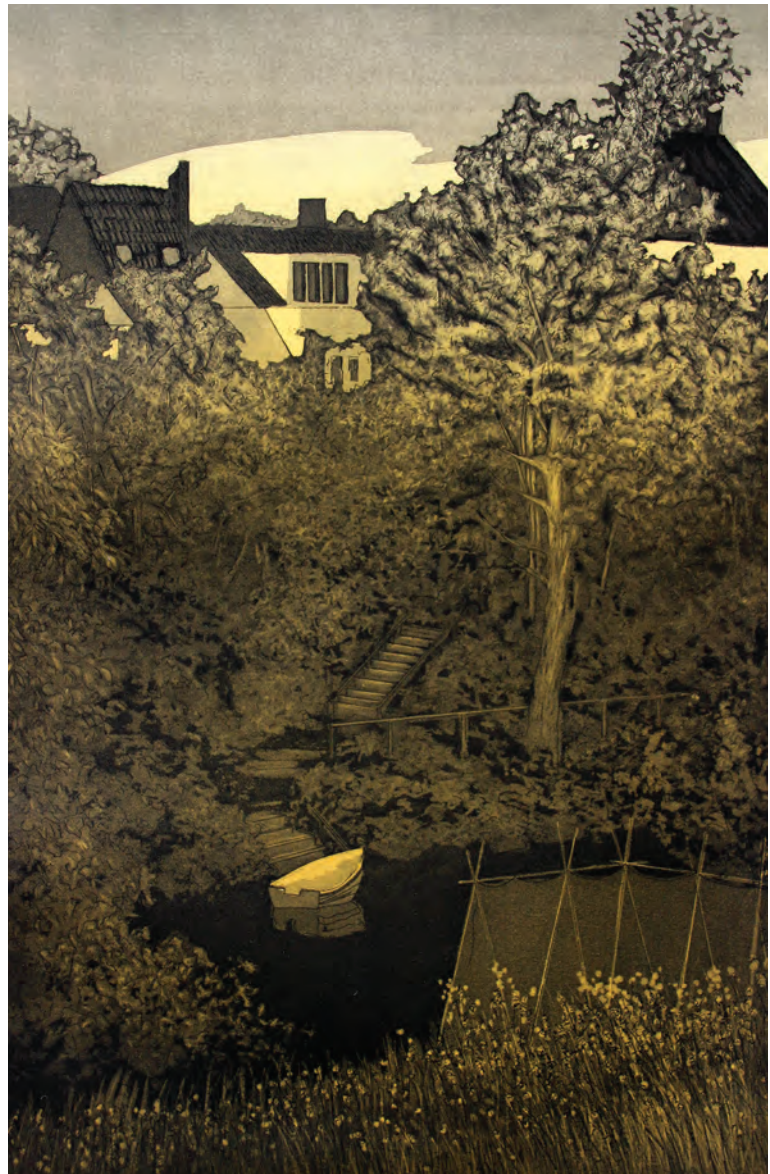
Lee Ann Frame, Stopping By , line etching, aquatint, and relief color roll