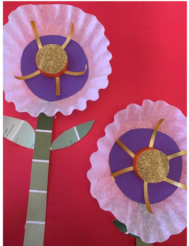
Materials used: coffee filters, construction paper, paint samples, glitter paper, bottle caps, ribbon

Check out these works from the KIA permanent Collection for even more inspiration! You can look at our collection online for more ideas! (Keywords: flower, bouquet, vase )