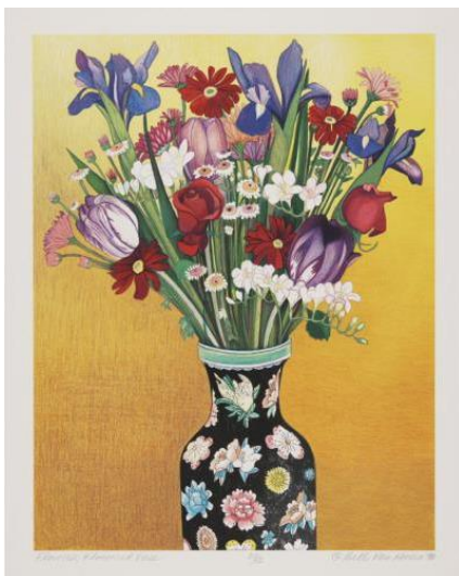
Flowers, Flowered Vase (Oriental Vase) , 1992, Beth Van Hoesen, KIA Collection

Check out these works from the KIA permanent Collection for even more inspiration! You can look at our collection online for more ideas! (Keywords: flower, bouquet, vase )