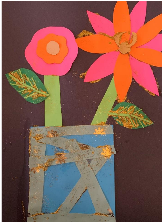
Materials used: construction paper, cardstock, wrapping paper, glitter